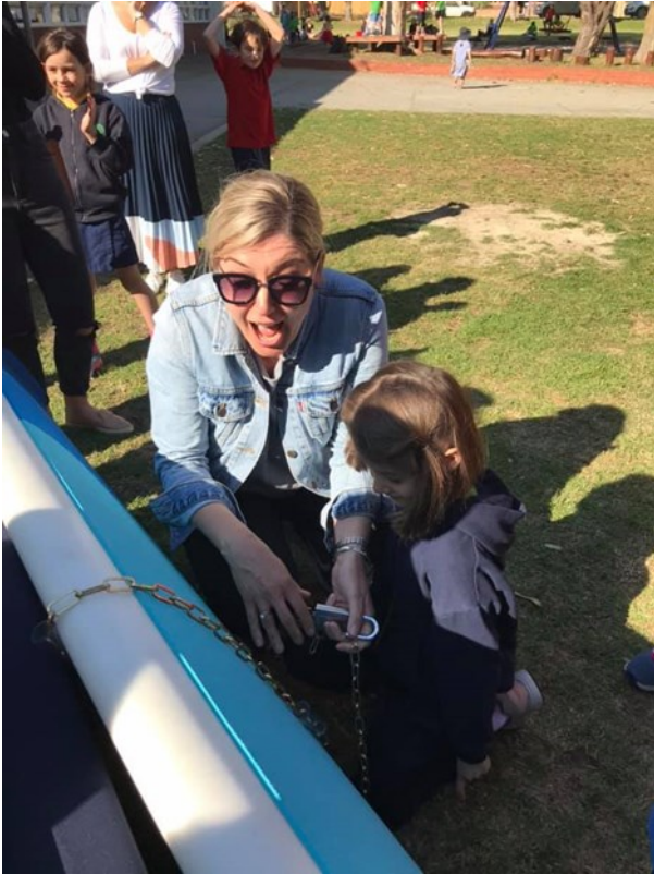
Best Photo Ever!

Thanks also to everyone who purchased a ticket. We love your generosity. ☐