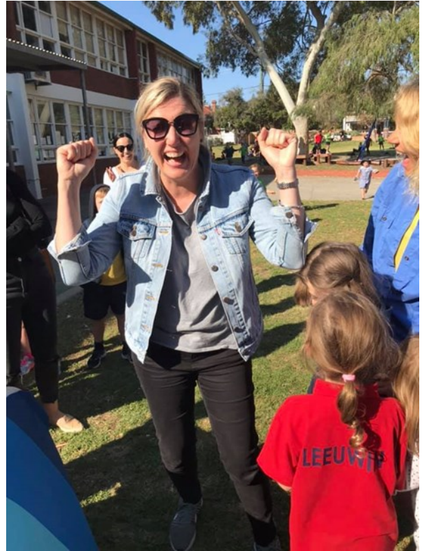
Winners are Grinners