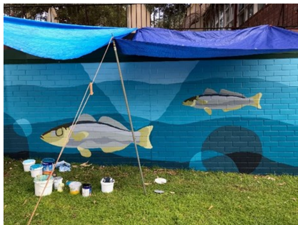
Protecting the Moorli Borlup