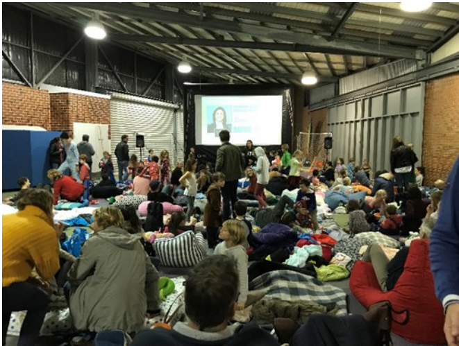
Dedicated followers of Movie Night